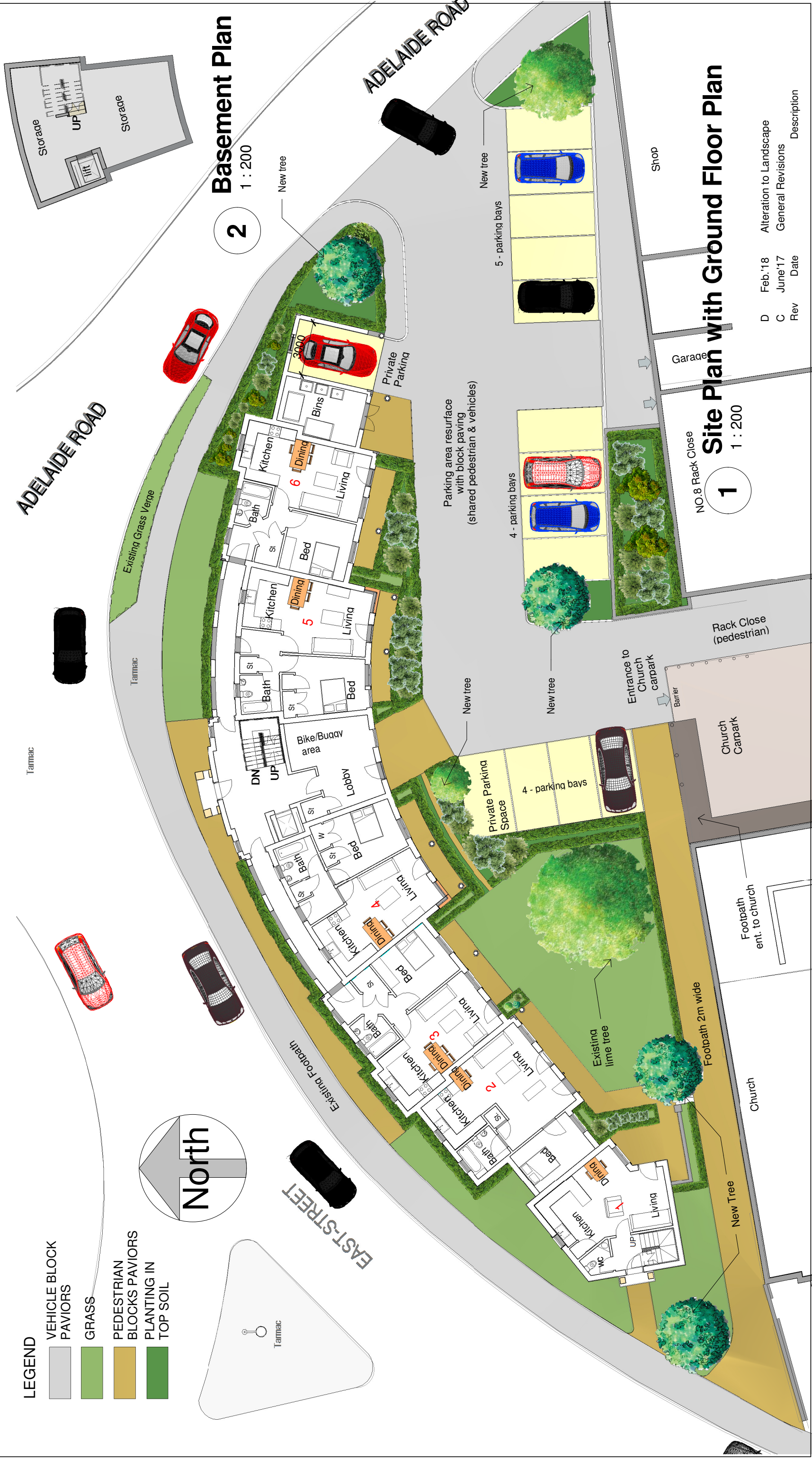
Basement Plan 1 : 200